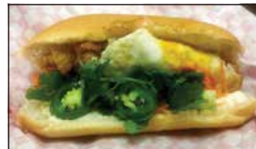
Chicken plus Fried Egg Sandwich