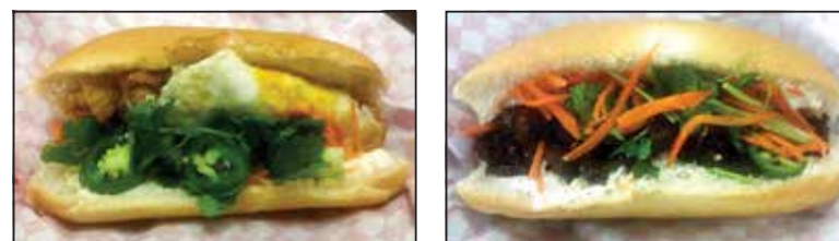
Chicken plus Fried Egg Sandwich

Buy 5 Sandwiches at regular price and get 1 FREE